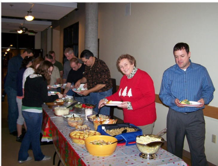
Time to fill up the plates!