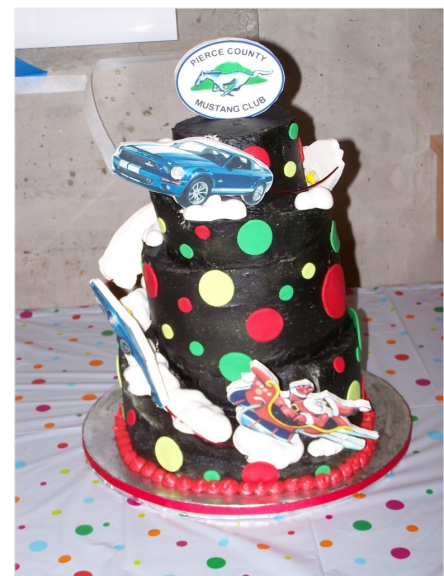
Cake furnished by Curious Cakes