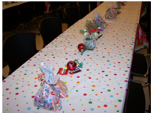
Table decorations by Monika Kirkland