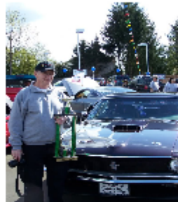
1st Place 2011