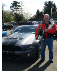
2nd Place 2011