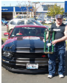
Best of Show 2011