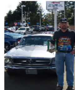
3rd Place 2011

Our annual opportunity to display our MUSTANGS and other FORDS and show our support to our Sponsor