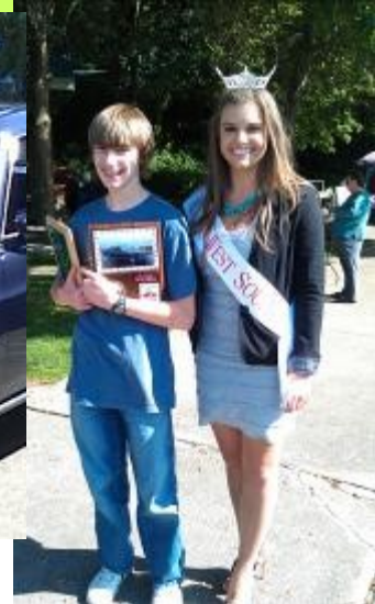
A MUSTANG NAMED ANTHONY

I purchased this car for $500 in 1983 when I was just 16 , a sophomore at Rogers high School in Puyallup. The car had “one last final start” in it. With LOTS of TLC it became a daily driver and an ongoing father/son restoration project. This car holds many fond memories.