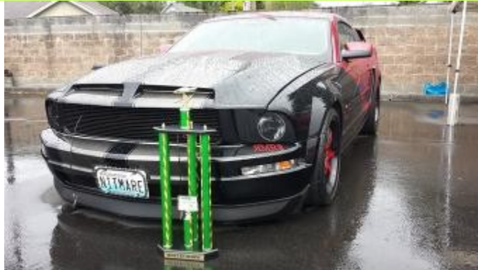
Best of Show – Ken Coatney