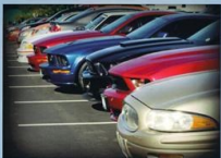
Pierce County Mustang Club Pony News with Cars and People