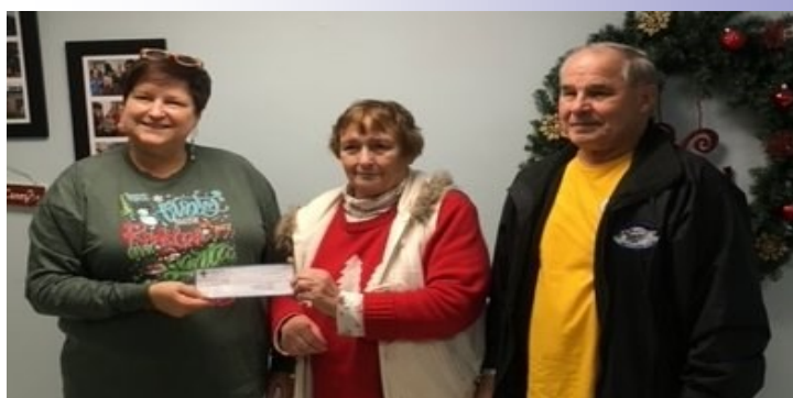
Santa Castle's Elf is full of smiles knowing how our monetary gift and the 750 pairs of Bombas socks will come in handy.